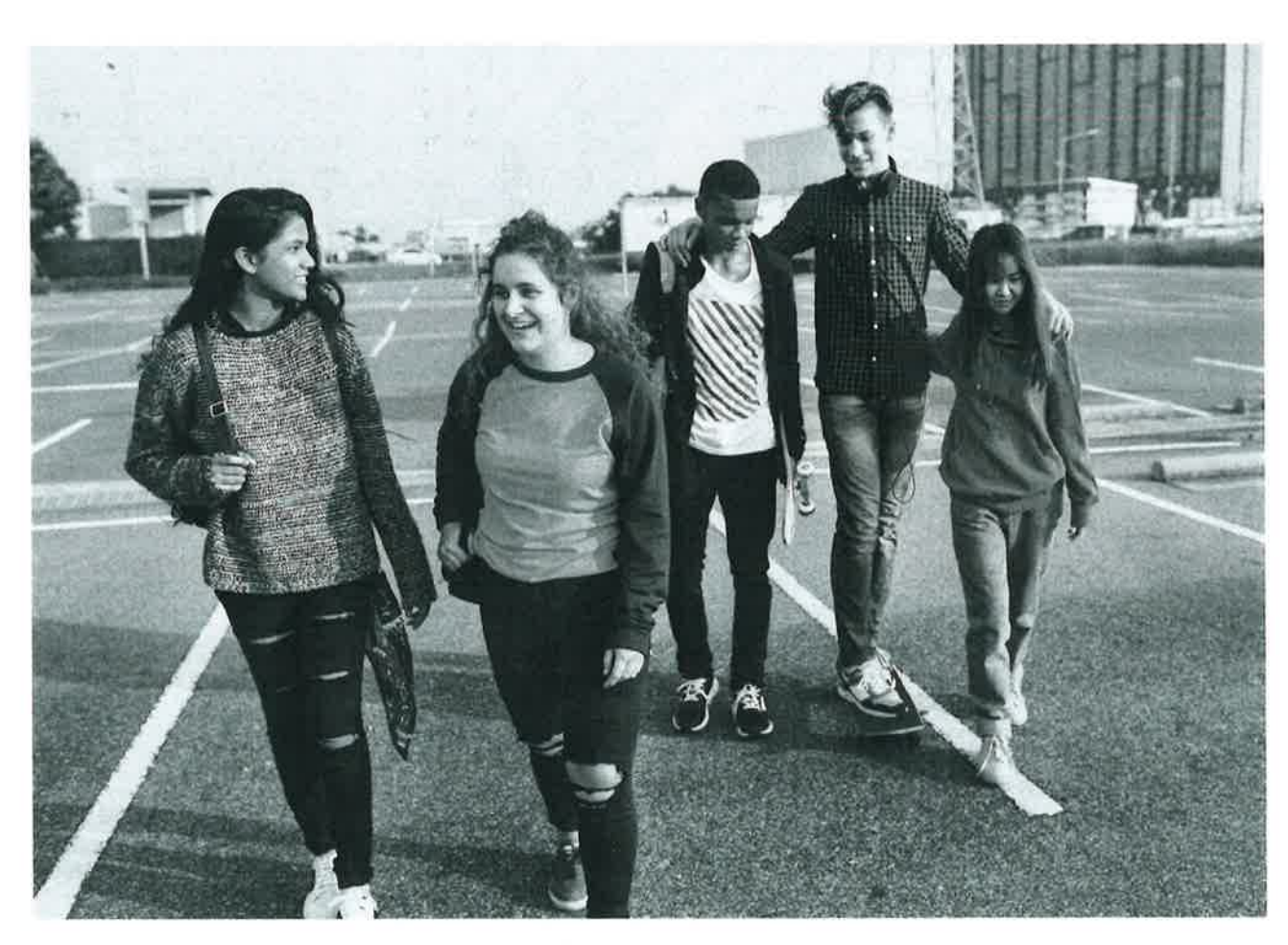
© 2022 National Alliance for Children's Grief | ChildrenGrieve.org