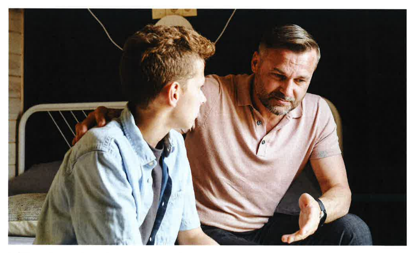
© 2022 National Alliance for Children's Grief | ChildrenGrieve.org

Communication with special needs children is as important as speaking with any child. If you are looking for information on how to support a child with special needs, view our <u>Supporting Children of All Abilities Who are Grieving Toolkit</u>.