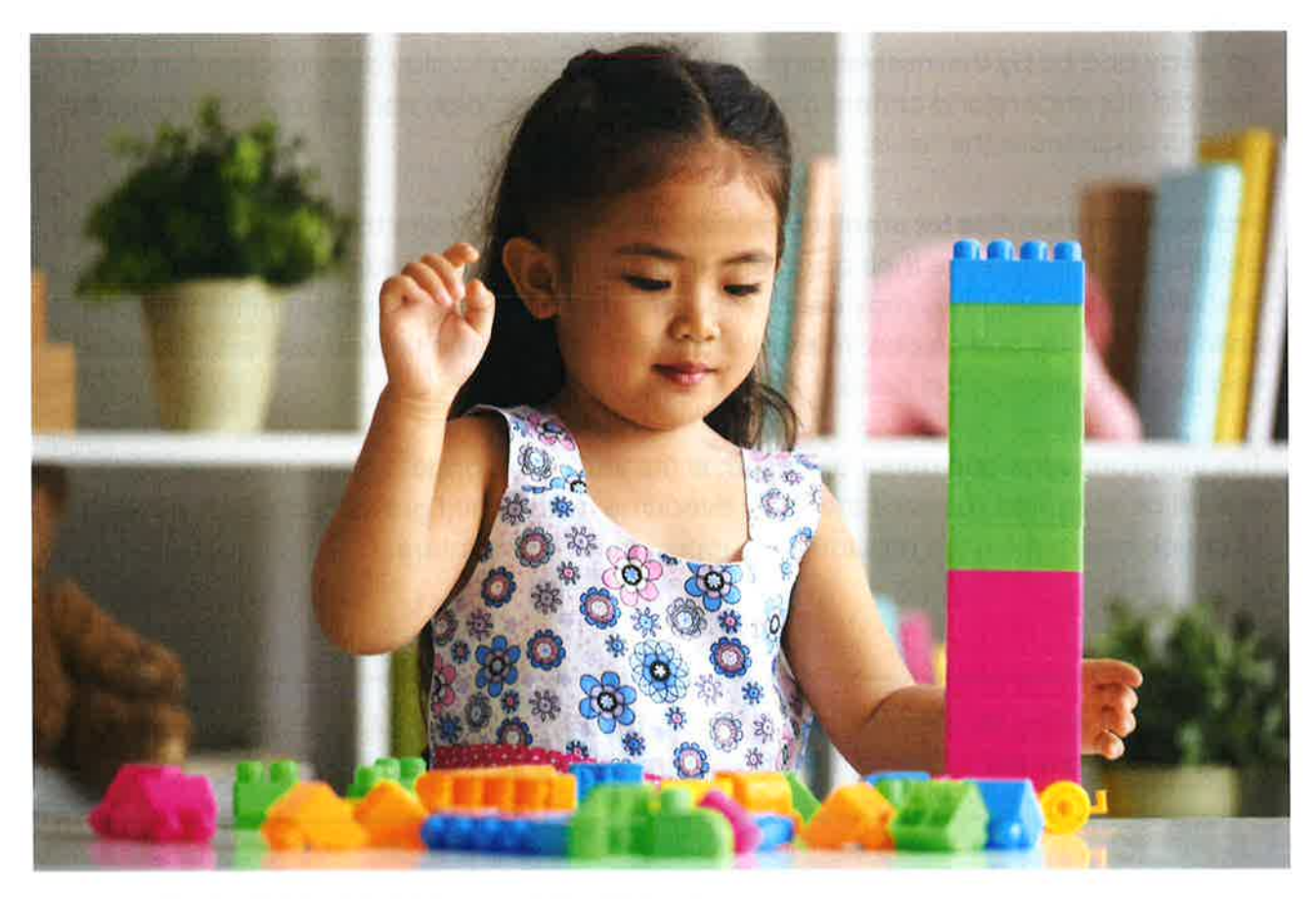
© 2022 National Alliance for Children's Grief | ChildrenGrieve.org

As caregivers, you are the primary source of security for your children— your continued reassurance about your presence and support is crucial. Extended family members and others may also provide important support, and you can discuss with them how they can be helpful.